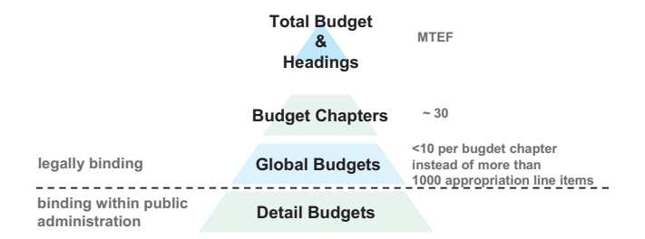
Figure 2: The new budget structure

line items and thus, streamlining the budget. Instead of more than a thousand line items, the future budget should consist of about a hundred global budgets. For a decentralised budget management, the legally binding global budgets will be further divided into detail budgets whereby the latter will only be binding within the public administration.